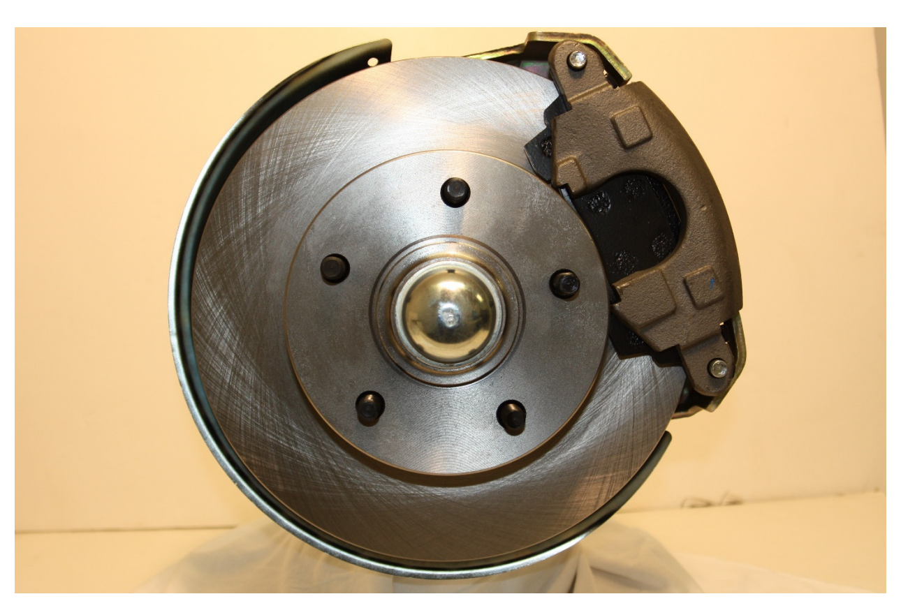
←Front Of Car