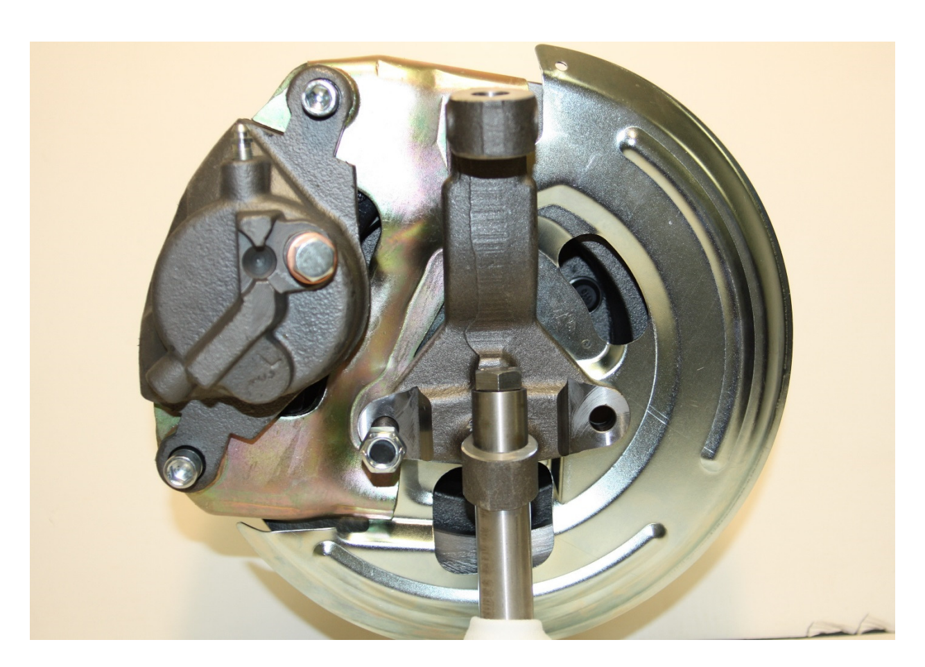
Front Of Car→