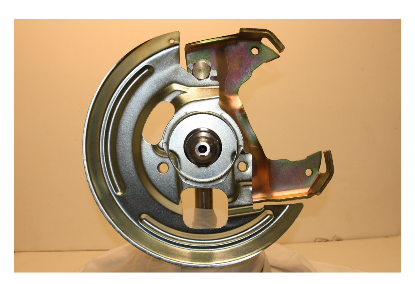
←Front Of Car